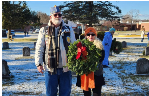
Squadron 96 (VT) at Bennington Vermont Veterans Home