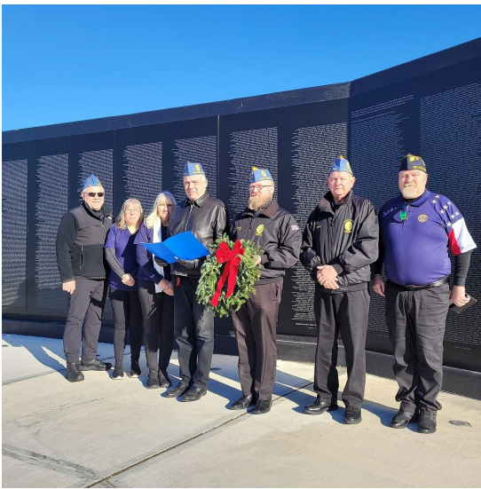
Submitted Photo: Members of the 105 Family at the Vietnam Veterans Memorial Wall

The only ones at the memorial when they visited at 9am on the 35 degree Saturday morning, the eight members from American Legion 105 visited the memorial, located at