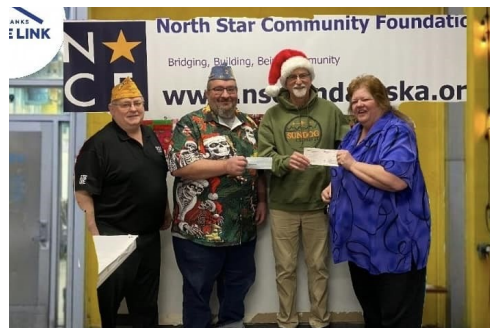
Unit and Squadron 57 (Fairbanks, AK) made donations to the new Warming Center of Fairbanks