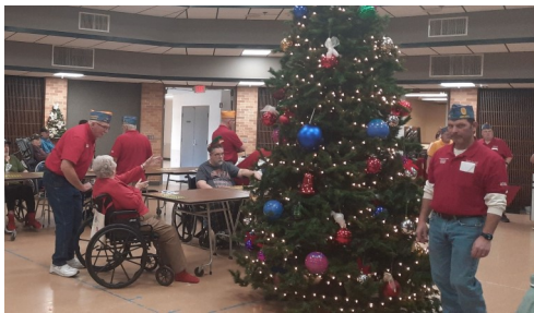
The Detachment of Indiana spending the holiday with our vets at the Indiana Veterans Home