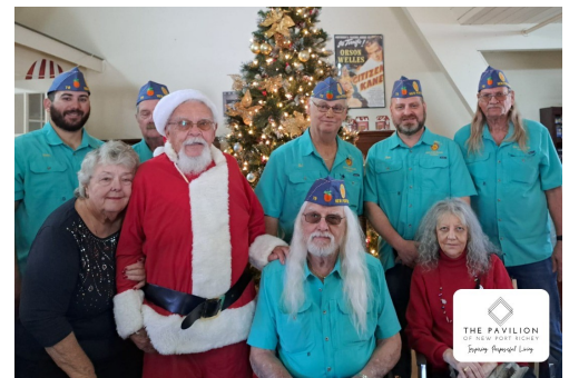
The Sons of New Port St. Richey, FL helping to treat the residents of The Pavilion of New Port Richey, a retirement & assisted living facility, to a Christmas Celebration.