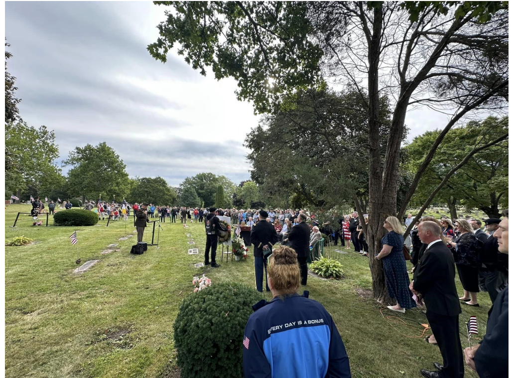
Submitted Photo: Members of the motorcycle escort, among others, at Graceland Cemetery in Racine, WI

During the escort, it was heartwarming to see one Fire Department displaying the American Flag high above the highway as we drove by. Numerous other departments stood along the roadside paying tribute to this soldier. Several smaller groups of citizens stood at driveways and parking lots with hands over hearts and a few salutes as we drove past.