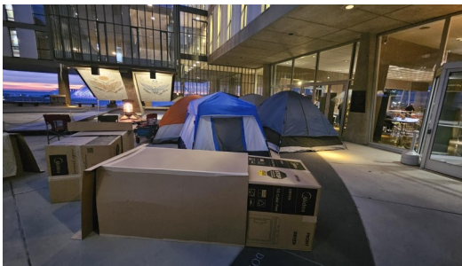
The camp, with tents and boxes