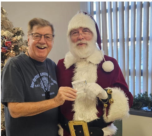
Squadron 408 (Derby, KS) welcomes aboard Ol' Saint Nick as a new member.