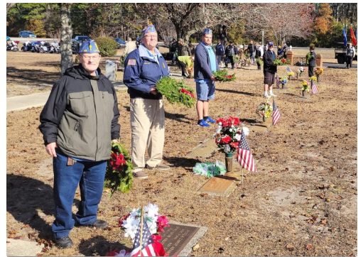
Squadron 186 (Little River SC) at North Myrtle Beach Memorial Gardens