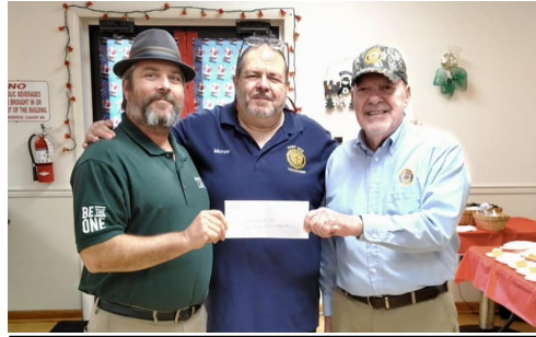
American Legion Post 282 Family (Woodsboro, MD) running a Children's Christmas Party, making a donation to the Commander's Playground Project, supporting building a playground for the Southern Maryland Youth Camp