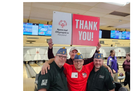
The Detachment of Maryland, as they do each year, sponsoring the Special Olympics Maryland Bowling Tournament