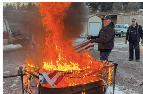
Squadron 71 (Battle Mountain, SD) participating in a Flag Retirement Ceremony