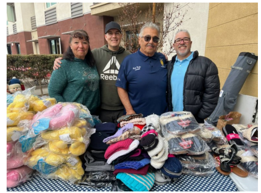
Squadron 155 (Colton, CA) working a Christmas event at US VET'S Homeless Village at March AFB