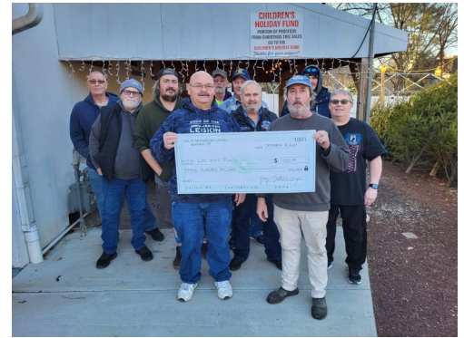
Squadron 113 (Frenchtown, NJ) making their annual donation to their post's Holiday Fund