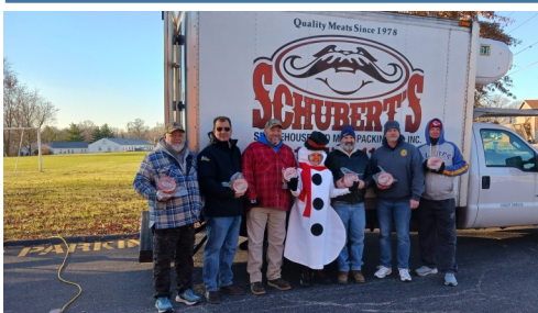
Squadron 581 (Columbia, IL) handing out to veteran families 200 hams at JB Patriot Pantry