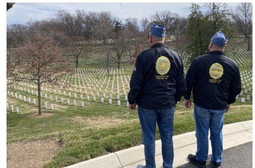
Members from the New Jersey Squadron 105 at Arlington National Cemetery

If you are interested in participating in this event, reach out to your detachment leadership for more information on how to register.