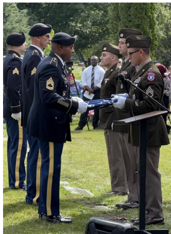
Honorguard at Graceland Cemetery in Racine, WI

As the First District SAL Commander and Legion Rider, it was my honor to help in arranging just some of the details for the motorcycle escort from the airport to the funeral home in Racine, WI.