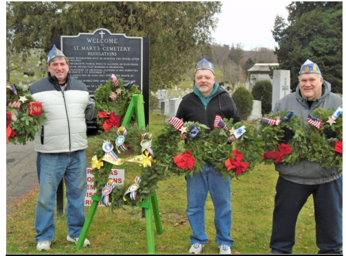
Sons of District 12 in Pennsylvania at St. Mary's Cemetery in Hanover, PA.